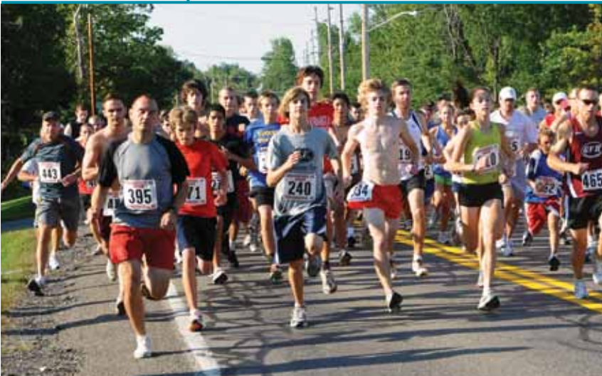
5th Annual Crosswinds 5